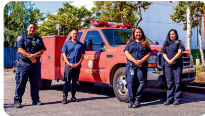
ABOVE RIGHT: The present day Montebello Community Assistance Program (MCAP) team.

Stepping into the 1970s, a pivotal advancement was the establishment of the first Paramedic Rescue Team in 1972. This pioneering step introduced advanced life-saving treatment even before patients reached hospitals, making a profound difference in life-or-death situations.