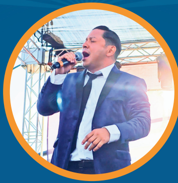
Saturday, October 7