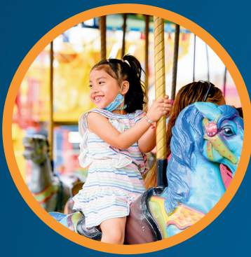
Friday, October 6

Montebello City Park, 1301 W. Whittier Blvd.