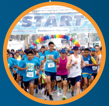
Sunday, October 8

Live music, beer garden, carnival rides, food, games, cultural performances, artisan & craft vendors, and more! Visit tinyurl.com/2023HeritageFest for up-to-date info!