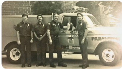
ABOVE LEFT: Montebello Fire Department's first Paramedic Rescue Team in 1972.

“ In the midst of gearing up for transformative changes to enhance service for Montebello residents, let's take a moment to reflect on the incredible journey of the Montebello Fire Department. Commissioned on June 20, 1922, the department's initial mission was to serve a population of 3,000. Fast forward to 1965, the population had surged to over 40,000, requiring 54 dedicated fire personnel to respond to 400 fire calls and over 400 rescues that year alone.